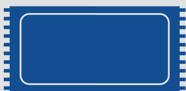
rugs and carpets

The eggs are laid in the pet's coat and drop off the pet almost anywhere it may roam, especially where your pet sleeps: